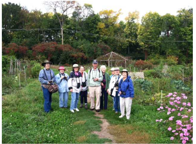
Gardens attract birds as well as lakes and woods.