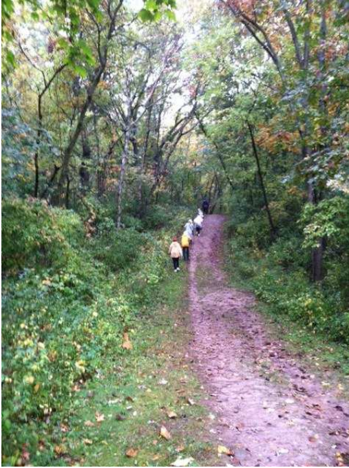
Checking out what's up the road.

The Bird Study Interest Group has been busy this Fall. Here they are out and about at Indian Lake and at Eagle Heights Gardens.