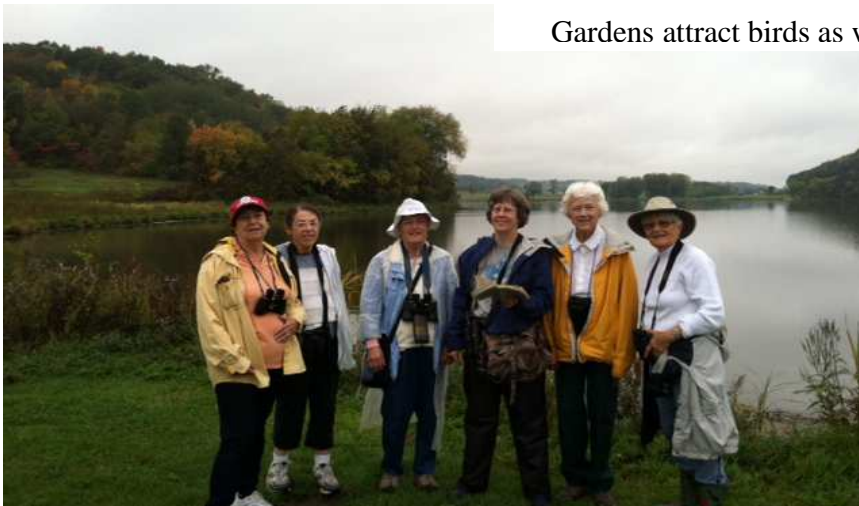
We thought there were water birds on the lake--but where??